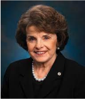
Senator Dianne Feinstein