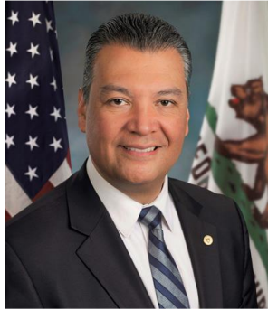
Senator Alex Padilla