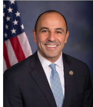
Rep. Jimmy Panetta, 19 th Dist.